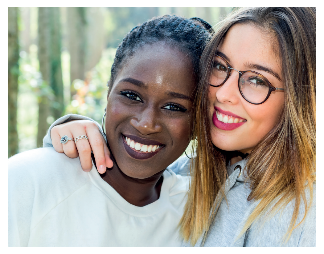
Girls on Board - Parent Guide